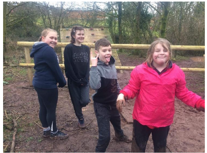
Year 6 on Residential - this sums them up as individuals perfectly.

They are all going to different secondary schools which just goes to show what confident young people leave our school. They will absolutely fly and I am looking forward to hearing about their progress as they head off on an exciting journey.