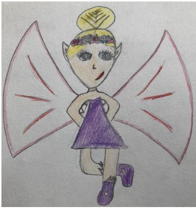
Independent: Poppy Y5