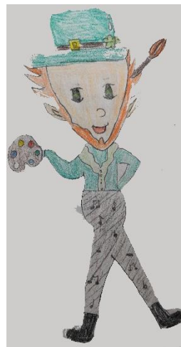
Createachaun Brooke - Y6

As you may have seen on my blog, five children had their mythical creatures selected to be the face of a curriculum driver.